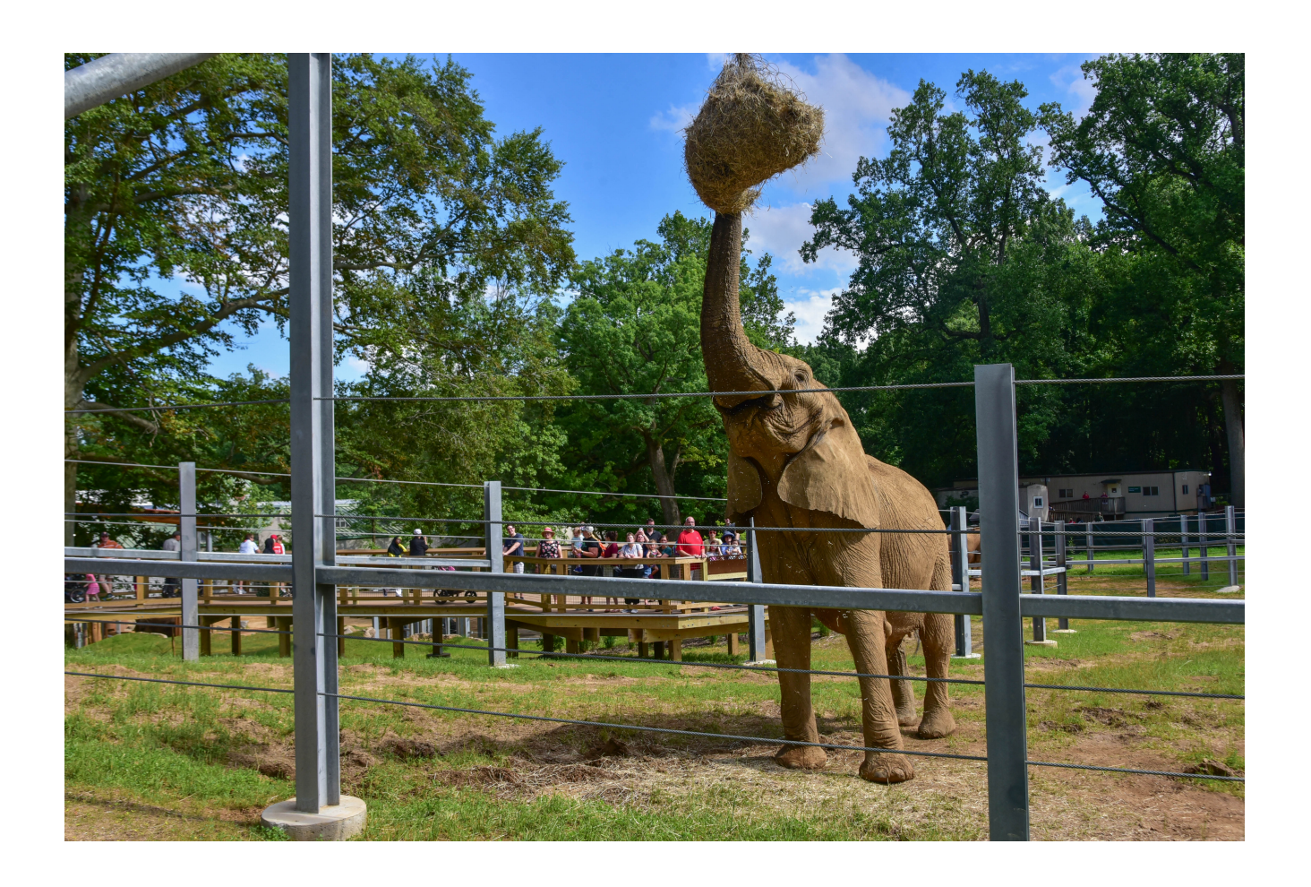
The Maryland Zoo

The elephant habitat totals more than 91,000 square feet now: The outdoor habitat grew from 30,000 to 77,330 square feet. Indoor holding space expanded from 9,900 to 14,300 square feet.