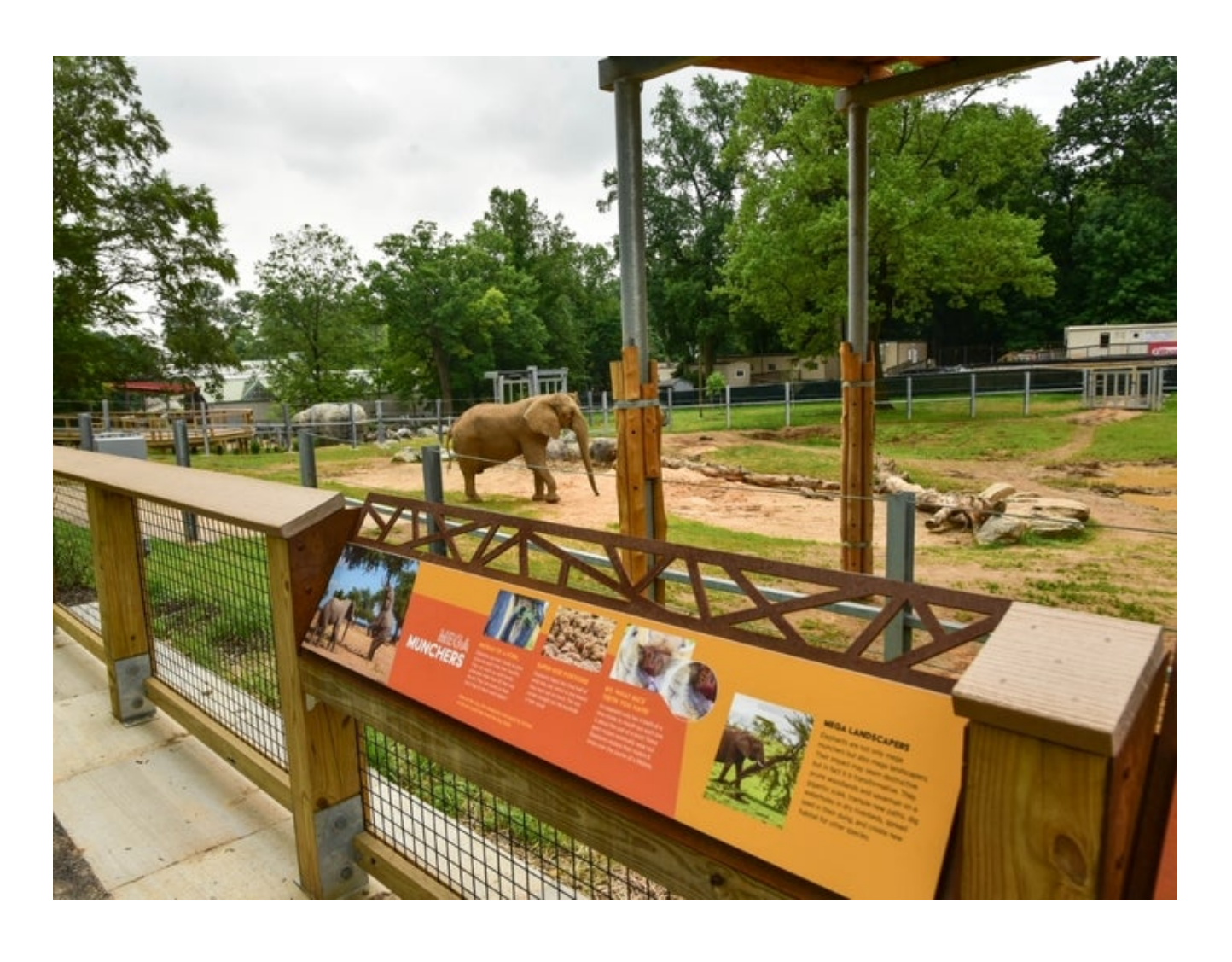
The elephant yard nearly tripled and is designed to be like a savanna.