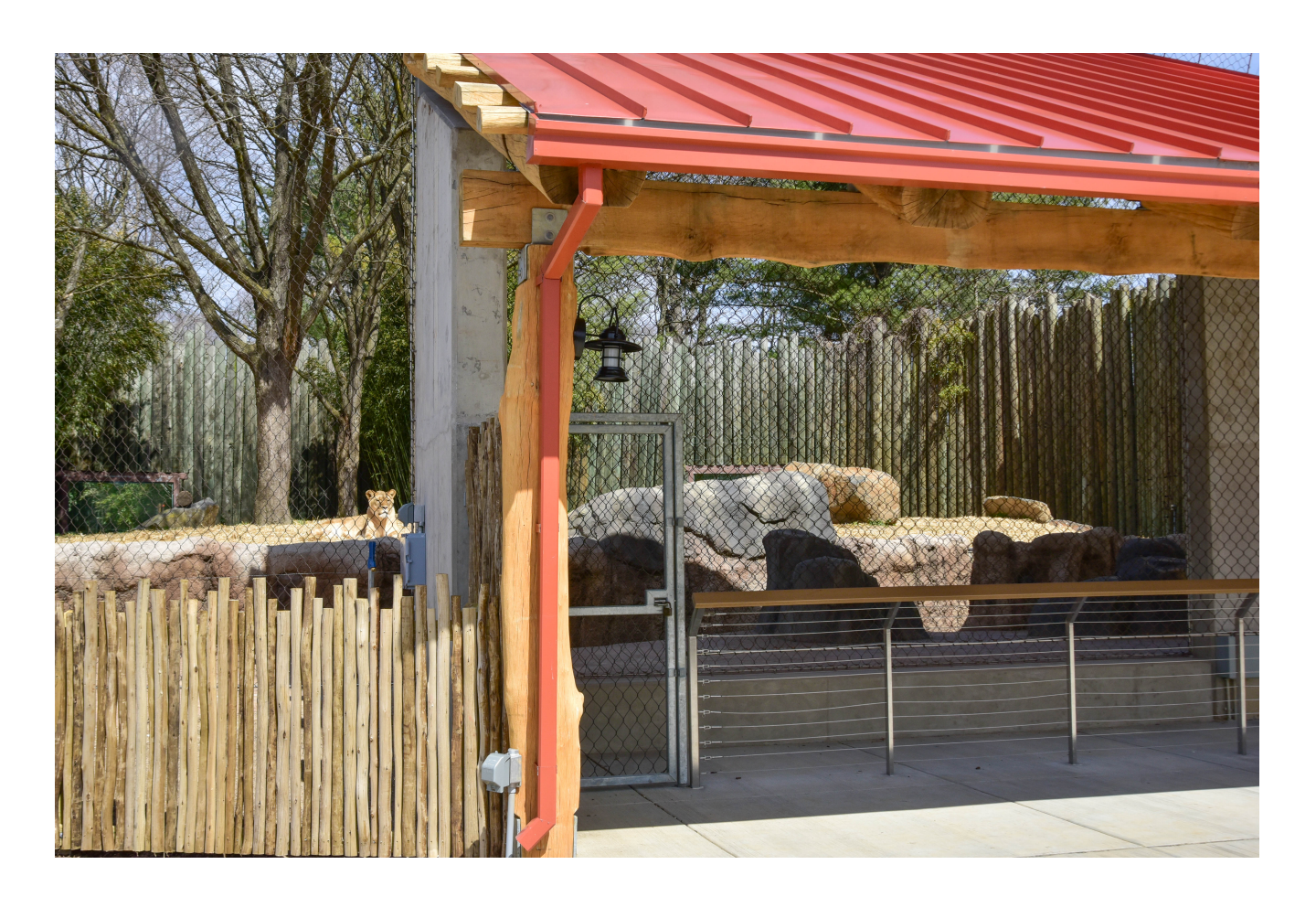
The Maryland Zoo