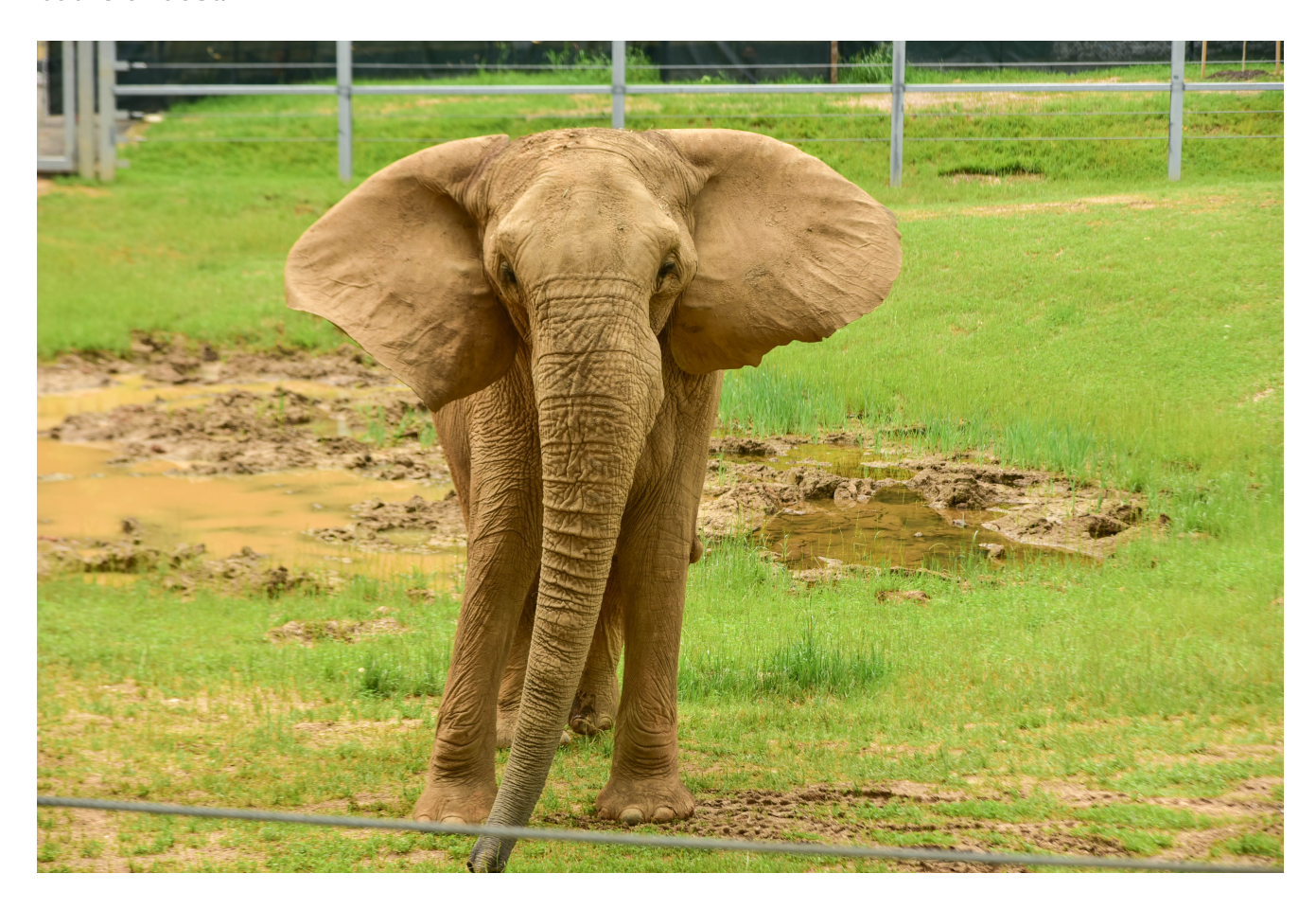
The Maryland Zoo

There is an enrichment zone now for the elephants, where they can wallow in the mud, bathe or dust.