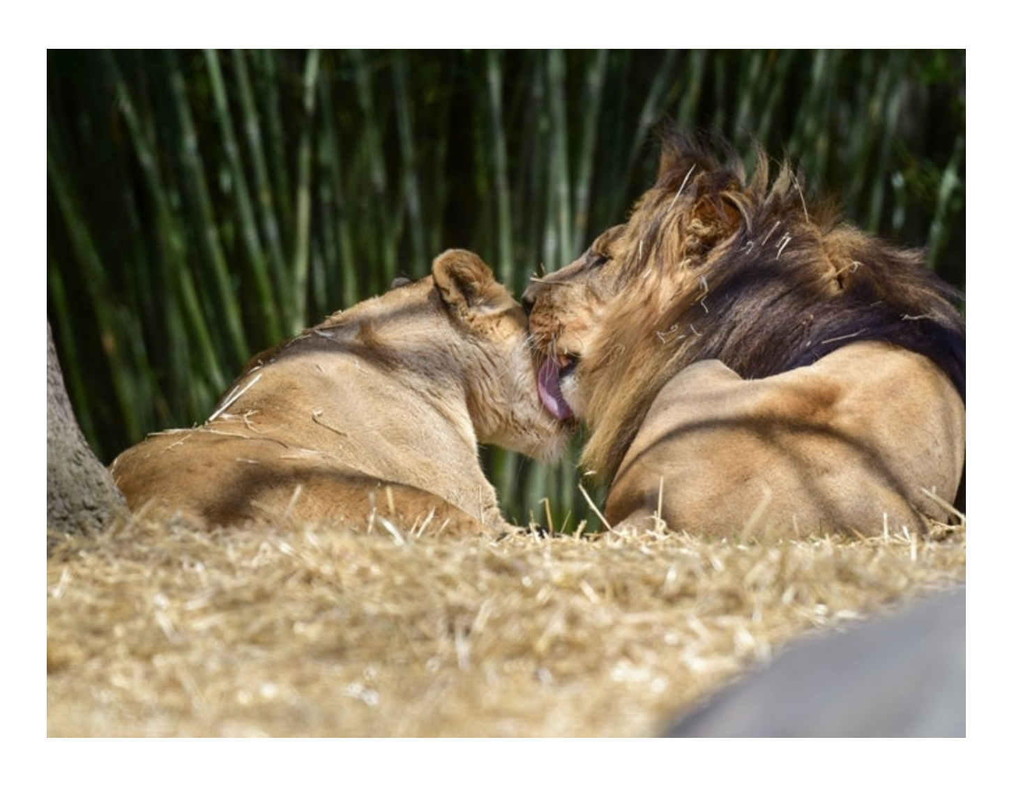
The lions are visible on one side of a newly created visitor path, while the giraffe are on the other side. (The Maryland Zoo)