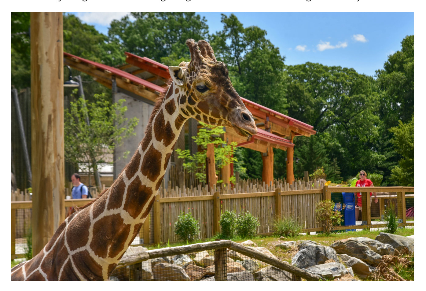
The Maryland Zoo

Officials say the giraffe have been getting acclimated to their new digs since May.