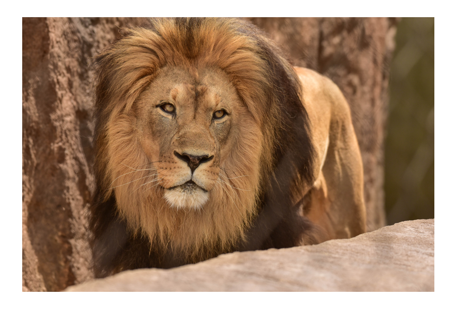
The Maryland Zoo

There's also a raised area in the center where lions can lounge.